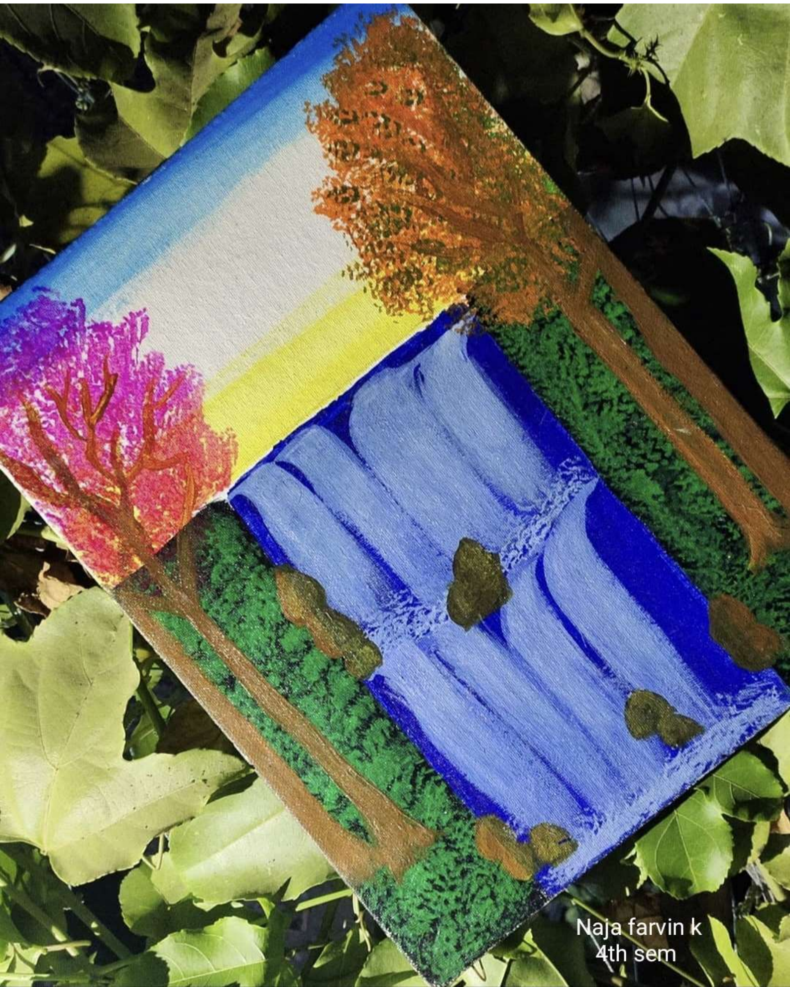
Naja farvin k 4th sem